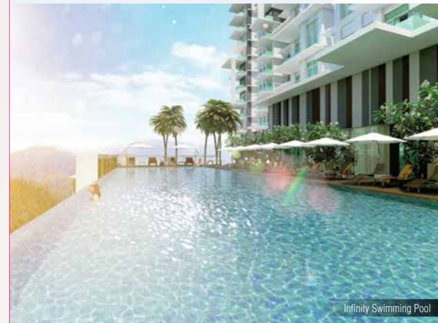
Infinity Swimming Pool

Live on the pinnacle of breathtaking tranquility; where the perfect living space awaits amidst lush green hills. As a Green Building Index (GBI) certified residence, Setia Pinnacle presents a healthy living ambience – reducing its impact on the environment. Through our efficient management of resources such as energy, water and materials; a green utopia emerges.