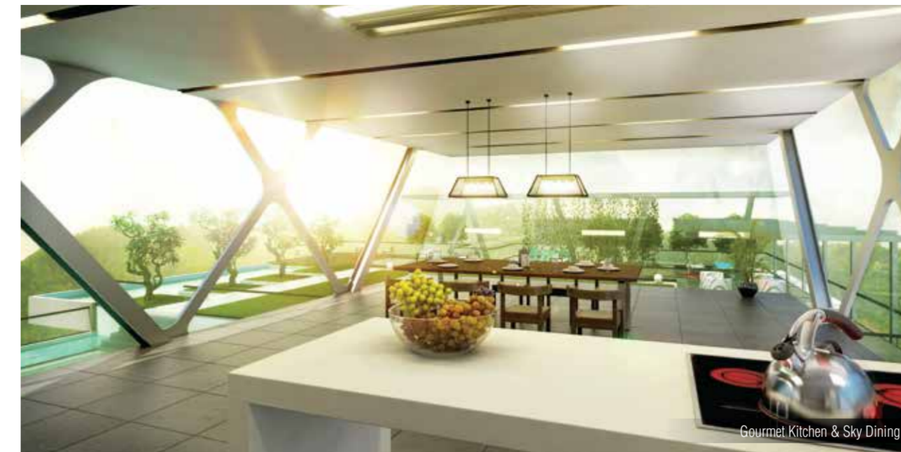
Gourmet Kitchen & Sky Dining

The Green Pavilion (Level 8) provides the ideal setting for fun family outings. Let the children enjoy the pool as well as the games and play rooms while you unwind. Relaxation presents itself in several ways – including a swim in the pool, sweating it out at the gym or savouring a run through the jogging track. From excitement to peace of mind, Setia Pinnacle's various features ensure that it will attain a special place in the hearts of many.