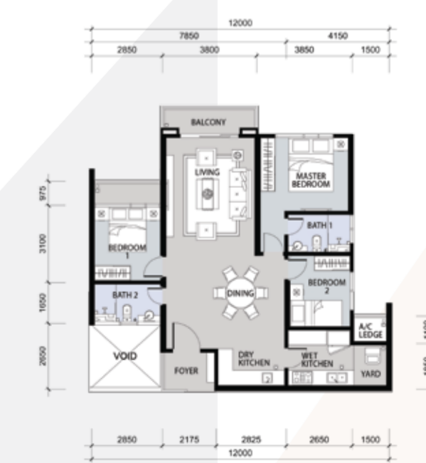
Type C Total Built-Up: 1,095 sq ft