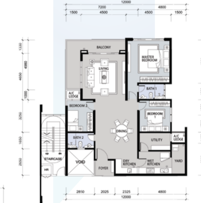
Type A Total Built-Up: 1,515 sq ft