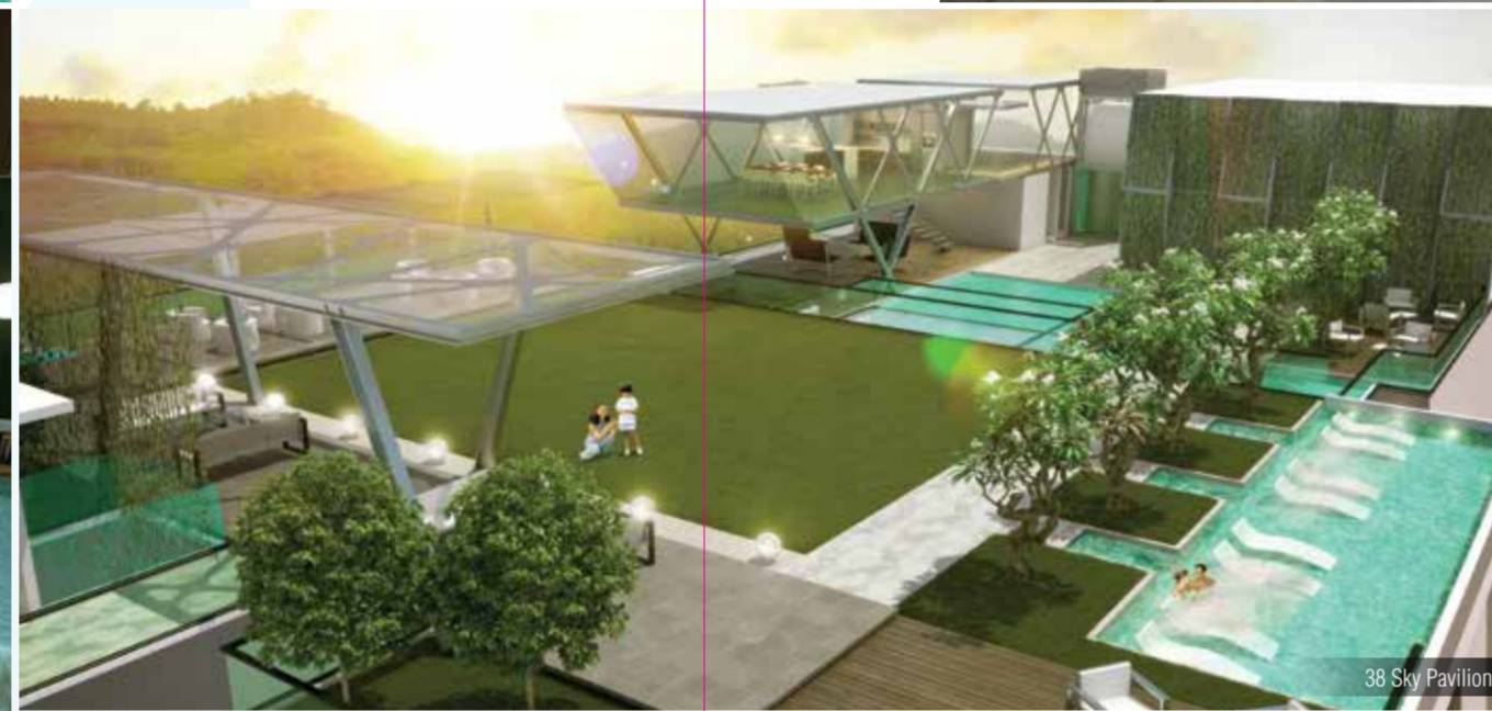
38 Sky Pavilion