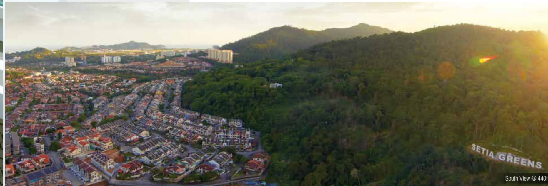
South View @ 440ft

For unparalleled sophistication, the rooftop is the place to be. Part of a two-tier facility feature, 38 Sky Pavilion offers lavish amenities such as a heated Jacuzzi, panoramic viewing deck, landscaped garden, entertainment promenade and a well equipped kitchen to prepare delectable meals amidst the blue skies.