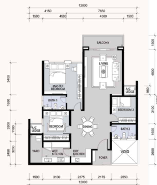
Type B Total Built-Up: 1,314 sq ft

Setia Pinnacle features a distinct staggered design – with a central core of six elevators dividing the two wings.